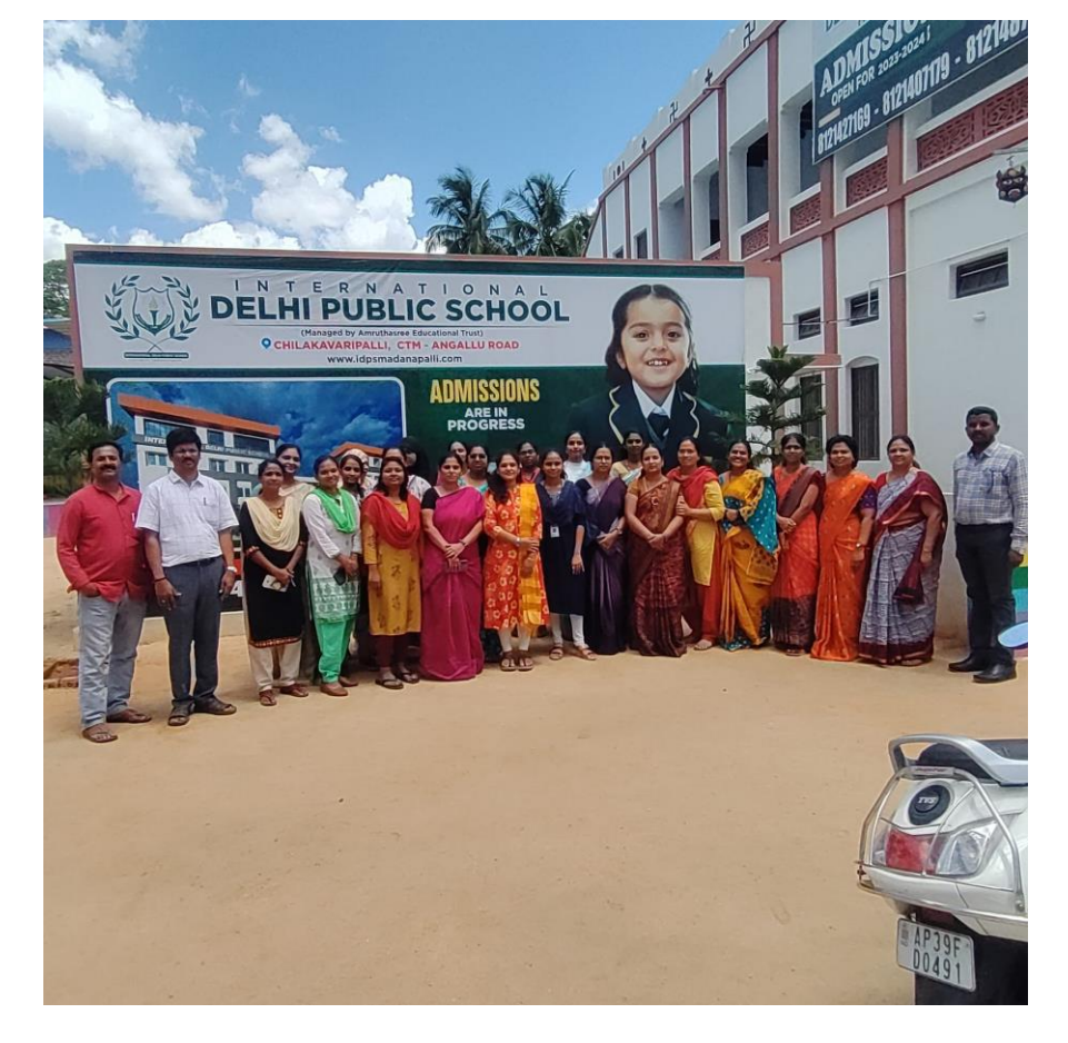
A Five - Day Faculty Development Program on Introductory Universal Human Values Organized by: International Delhi Public School, Madhanapelle in Association with UHV Cell, MITS.